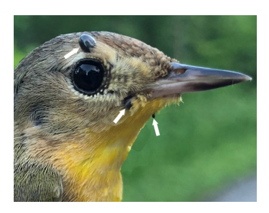
Figure 3. Common Yellowthroat, female, parasitized by blacklegged ticks, Ixodes scapularis . This ground-foraging bird species was commonly infested by bird-feeding ticks.

Babesia odocoilei is a recently described malaria-like microorganism that was originally reported as apathogenic in cervine hosts [44]. Now, it is known to cause death associated with high levels of parasitemia in cervids (Artiodactylia: Cervidae). This cervid family includes white-tailed deer ( Odocoileus virginianus ), American elk ( Cervus elaphus canadensis ), and caribou ( Rangifer terandus caribou ) [45,46]. Mortality has been noted in captive and wild cervids in various parts of North America.