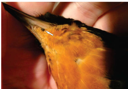
Figure 1. Varied Thrush, male, parasitized by a partially engorged I. auritulus nymph. This nymph was infected with B. americana , strain Can94.

Using real-time PCR, the nymph tested positive for B. burgdorferi s.l. with a CT of 29.05, which indicates a strongly positive sample. DNA sequencing of the flagellin gene yielded the expected 325-bp fragment characteristic of B. americana . After end-trimming, the amplicon from the I. auritulus nymph (15-5A94) collected from the Varied Thrush was 99% homologous with B. americana type strain SCW-41 located in the GenBank data