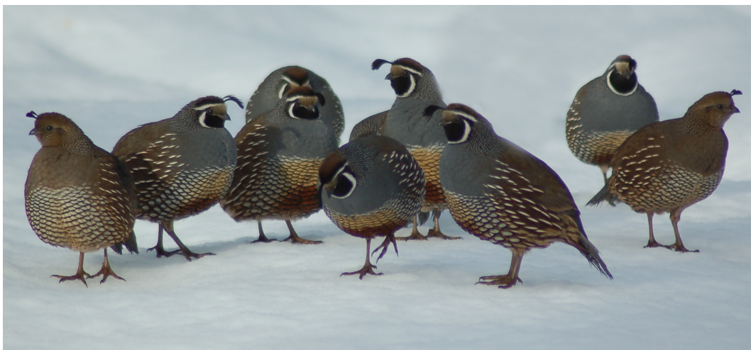
FIGURE 3. A covey of California Quail on Vancouver Island, B.C. after a rare snowstorm.

When California Quail forage, it is not unusual to encounter 20 quail, or more, in a single covey (Fig. 3). These ground-dwelling birds inhabit thick undergrowth and low-lying vegetation in southern British Columbia where they become parasitized by host-seeking ticks. In fact, they become maintenance hosts for ticks, and potentially these game birds may act as reservoir hosts for B. burgdorferi s.l.