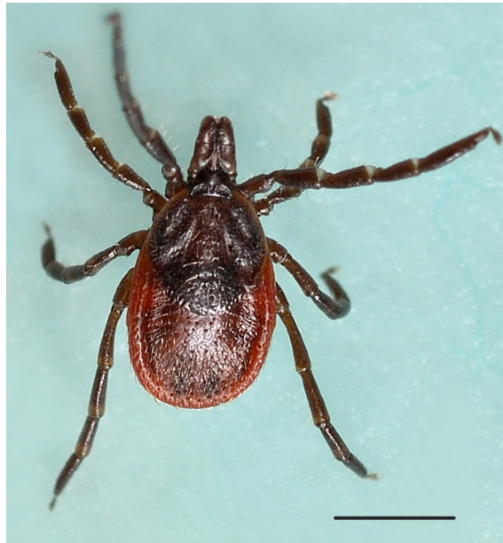
FIGURE 2. Ixodes pacificus , unfed female (bar, 1 mm), after molting from a nymph that was collected from a California Quail. Using PCR and DNA sequencing, this tick tested positive for B. burgdorferi s.s.