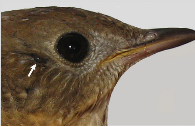
FIGURE 2. Hermit thrush parasitized by an engorged nymph of the rabbit tick, Haemaphysalis leporispalustris .

disease–endemic foci. Combining the present study and a previous pan-Canadian study (Scott et al., 2010), we have detected B. burgdorferi in 6 different bird-feeding Ixodes ticks. The collection of I. affinis in Manitoba, I. auritulus in the Yukon, and Amblyomma spp. ticks in Ontario illustrates the fact that migratory songbirds carry ticks thousands of km. Based on our high prevalence data for B. burgdorferi , outdoors people need to examine themselves carefully after frequenting grassy and woody habitats. Clinically, doctors need to be alert to the possibility that the ticks, which are discovered, might be infected, and patients treated accordingly (Oksi et al., 1999; Miklossy, 2008). Also, doctors should be aware that infection could happen almost anywhere in Canada.