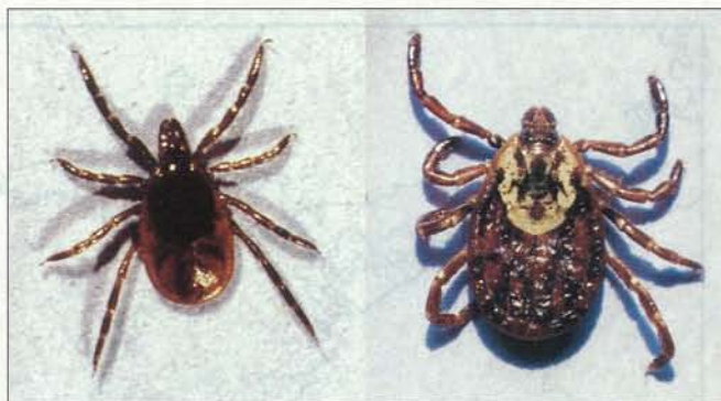
Fig. 1: Left: Blacklegged tick, Ixodes scapularis , unfed adult female. This tick is a competent vector for the spirochete causing Lyme disease, Borrelia burgdorferi . Total body length ranges from 2.0 to 3.5 mm; this specimen is 3.2 mm in length. Right: American dog tick, Dermacentor variabilis , unfed adult female. Total body length ranges from 3.0 to 5.0 mm; this specimen is 4.5 mm in length. This is the tick species most frequently submitted for identification in Ontario; it is not a competent vector for B. burgdorferi . Both ticks are found in southern Ontario.

The hosts of 121 (87%) of the ticks had no reported history of out-of-province travel. Two (1.6%) of these 121 ticks (1 from Mississauga and 1 from Etobicoke [part of Toronto]) produced motile spirochetes, which were subsequently identified as B. burgdorferi by monoclonal antibody and polymerase chain reaction tests (Table 1). In an additional 7 (5.8%) of the 121 ticks, B. burgdorferi was detected directly by polymerase chain reaction (Table 1). The first blood sample from host dogs was normally taken 4–6 weeks after tick removal. Subsequently, serum samples from all 9 dogs were tested by indirect immunofluorescence antibody assay and Western blot to identify specific antibodies against B. burgdorferi ; such antibodies were observed in all samples. In a few cases the indirect immunofluorescence antibody titres were low (Table 1); however, all of the Western blots were reactive, with 5 or more bands needed for identification. Because most dogs with Lyme disease are asymptomatic, Western blot provides valuable diagnostic