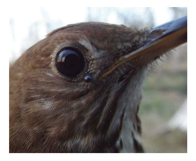
Figure 2. Veery, Catharus fuscescens , parasitized on the lower edge of the right eye by a fully engorged Ixodes scapularis nymph. This feeding site is safe from preening.

The clay-coloured sparrow Spizella pallida (Swainson) and the Gambrel's white-crowned sparrow Zonotrichia leucophrys gambelii (Nuttall) are first-time host records of I. scapularis .